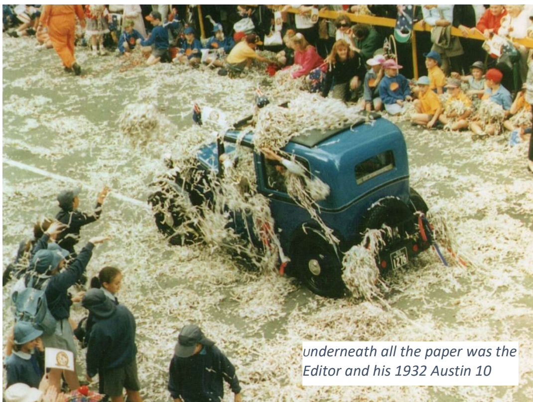
underneath all the paper was the Editor and his 1932 Austin 10

At one time the cars were seen to be covered in a storm of paper streamers as it passed along the bottom end of Adelaide Street, this picture appeared in the Courier Mail the very next day, making the owner very proud!