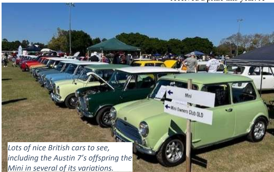
Lots of nice British cars to see, including the Austin 7's offspring the Mini in several of its variations.