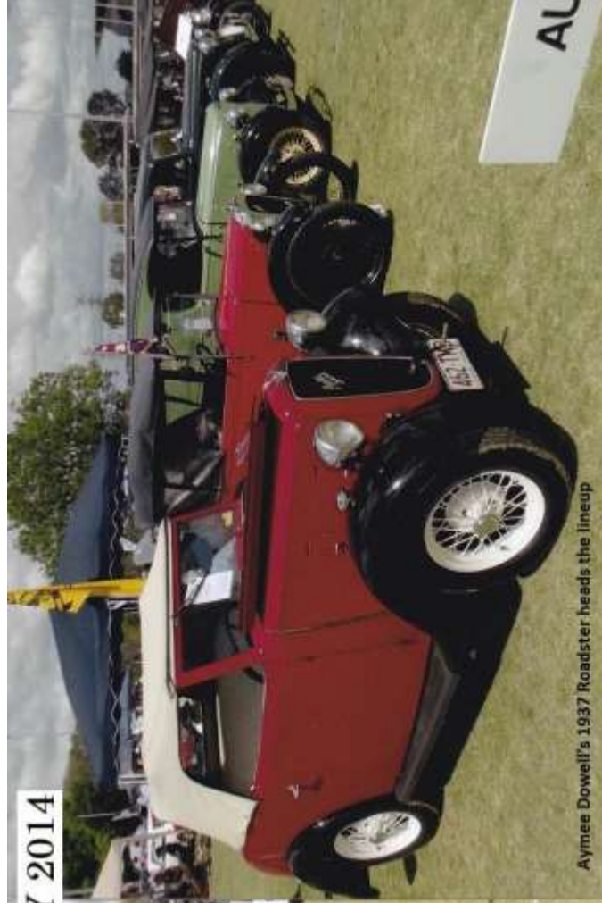
Aymee Dowell's 1937 Roadster heads the lineup