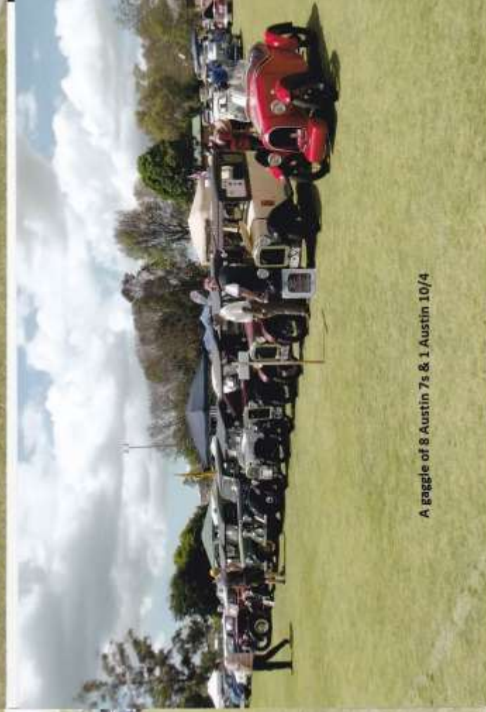
A gaggle of 8 Austin 7s & 1 Austin 10/4