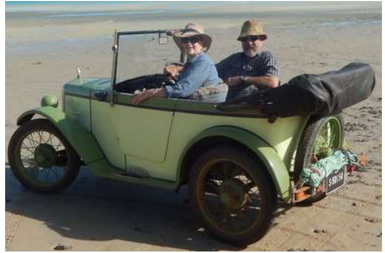
Road, Griffin Qld 4503

NEXT NEWSLETTER: WE MAKE CAPE YORK AND THEN THE HOMEWARD JOURNEY.