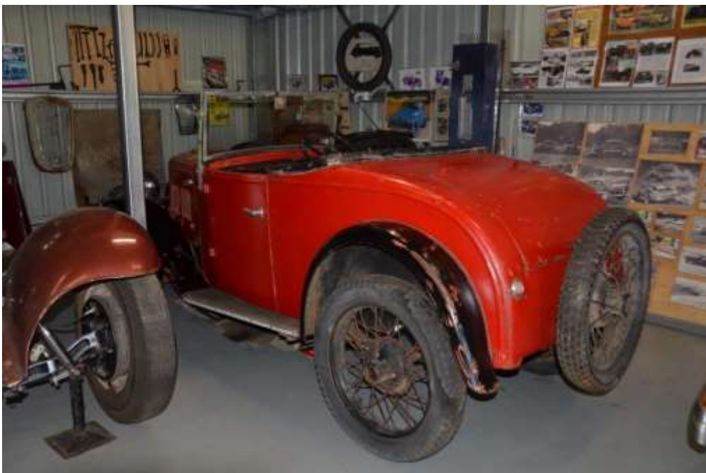
And this is their 1933 A7 Roadster, a future restoration project