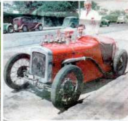
Left: The replica put through its paces on the gravel. Above: One of the original photos used when recreating the car.