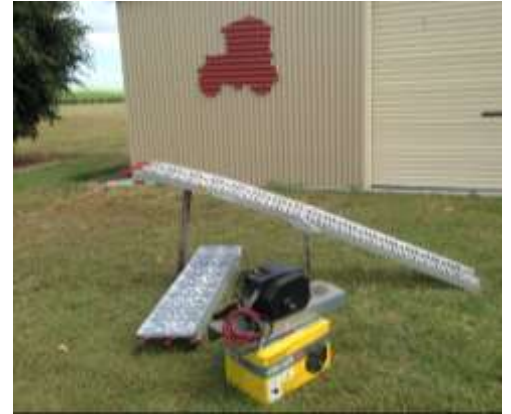
Right Photo - Ramps and winch

We have these couple of items that we no longer need. When we went to the Austin Seven Rally at Tanunda, we owned an Iveco van which was long enough for us to put one of our little Austin Seven cars in all secured, as well as tow our Caravan.