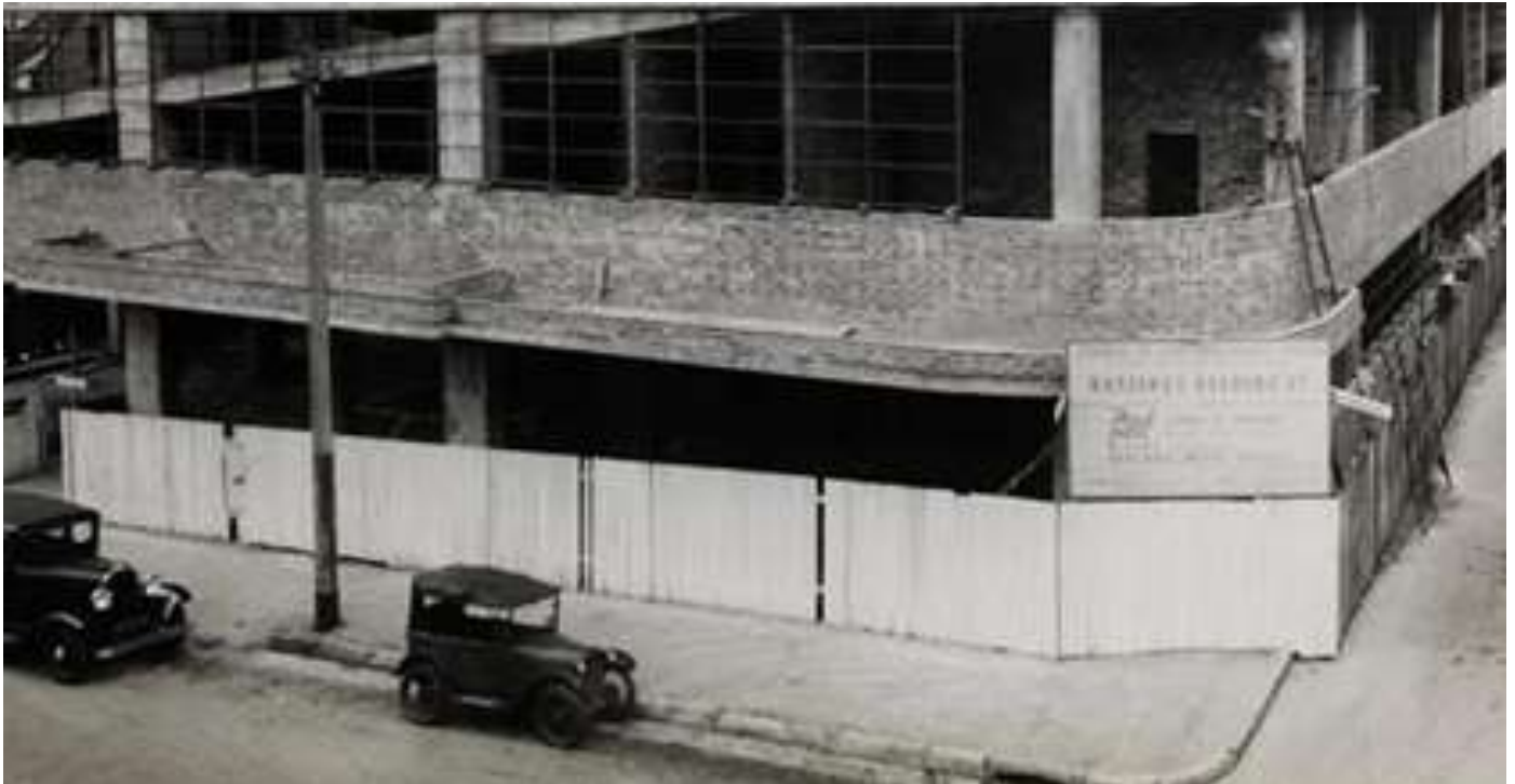
Construction of the Hastings Deering Building, Crown Street, Sydney, 1930s, early Austin Seven Chummy with black radiator, pre 1928 magneto model?