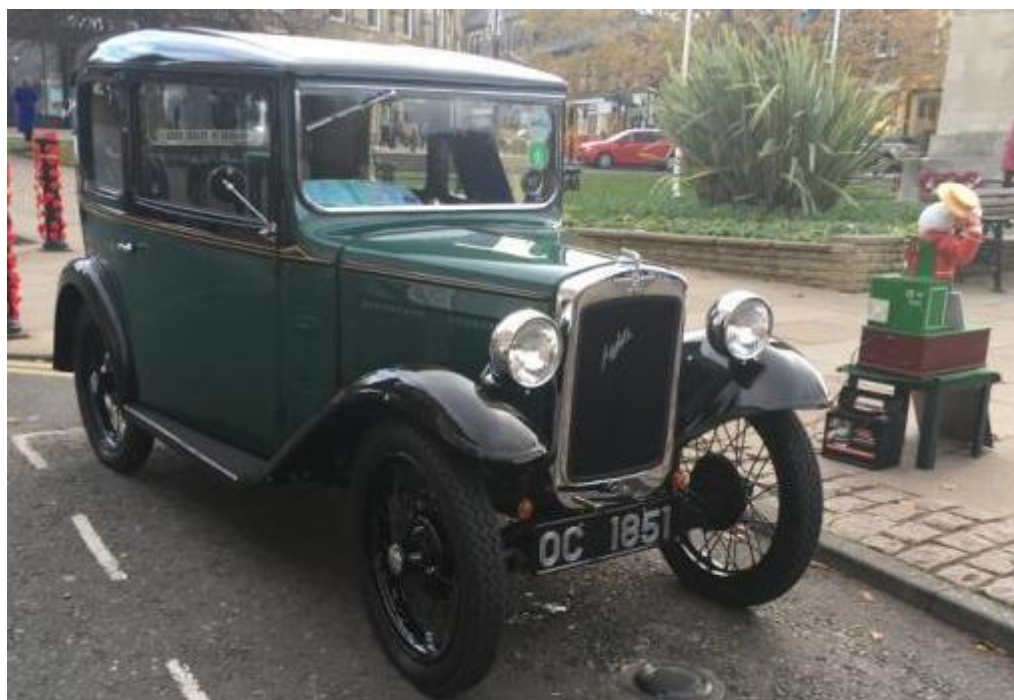
parked near the Harrogate War Memorial: