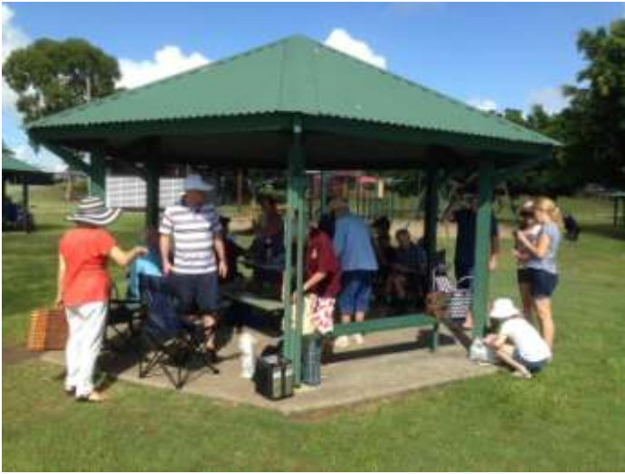
Lunch at Colmslie Beach Reserve.