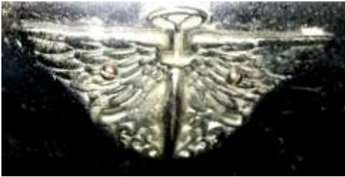
Above are the Radiator wings which screw on the radiator surround.

Photos show a general view of Bill and Karen's car. Note the 1930 style mudguards and chummy style body. Even the dashboard looks the same as the 1929/30 version as shown in the bottom photo. Interesting the starter is the bacon slicer, not the late 1929 direct starter. The gearbox has a gate change, again and earlier feature.