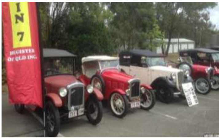
5 Brave little Austin 7s