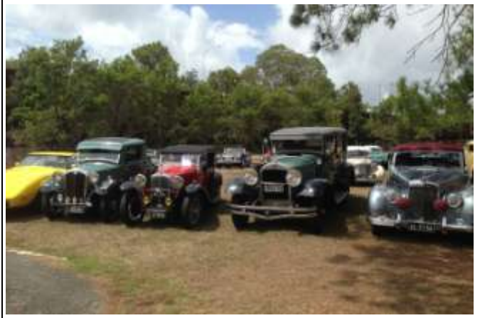
Others cars included these Wolseley Hornets, a Hudson and an Alvis