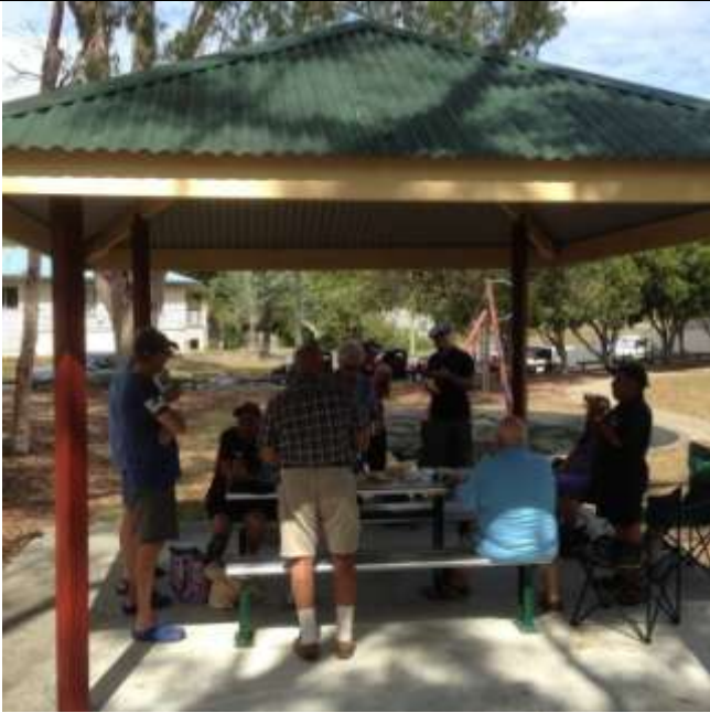
Majestic Park picnickers

At around 9am we set out under the Gateway Motorway and turned right into Mt Petrie Road. The run to the Morning Tea stop at Majestic Park, Coorparoo, took us through the suburbs of Carindale and Holland Park. Those of us arriving at Majestic Park realised that three of our Austins, which had been in front of us at the start, were not present. Apparently, a navigational error by the lead driver had them overshoot the park turn-off. Finally, a short time later, we were all happily reunited and proceeded to set up camp for Morning Tea under a lovely shelter.