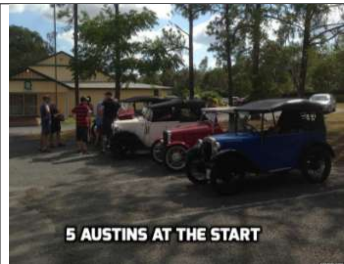
5 AUSTINS AT THE START