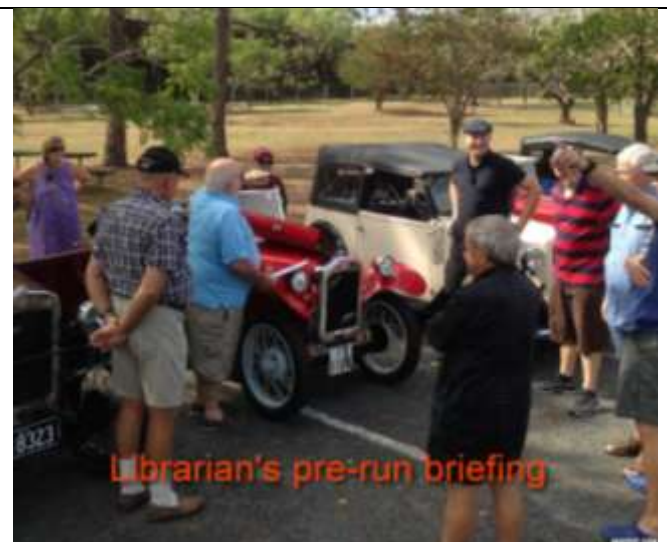
Librarian's pre-run briefing