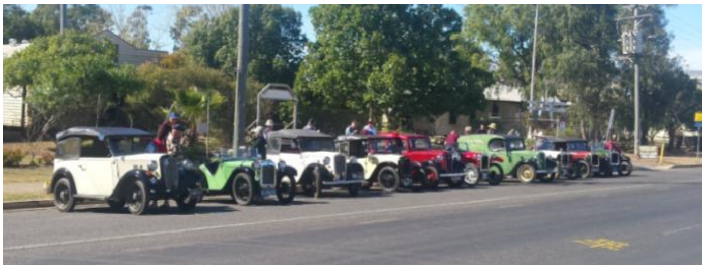
Austins Sevens lined up outside the Dalby Pioneer Park Museum on the Sunday