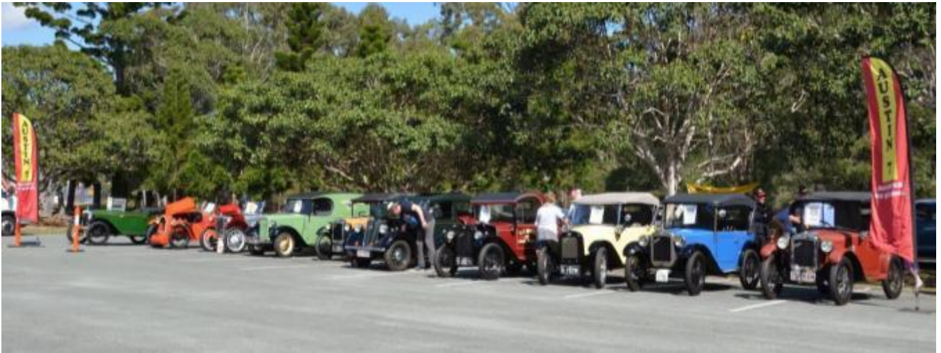
All the Austins at Capalaba for the 2017 Static Display