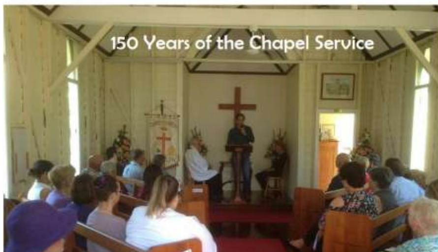
150 Years of the Chapel Service