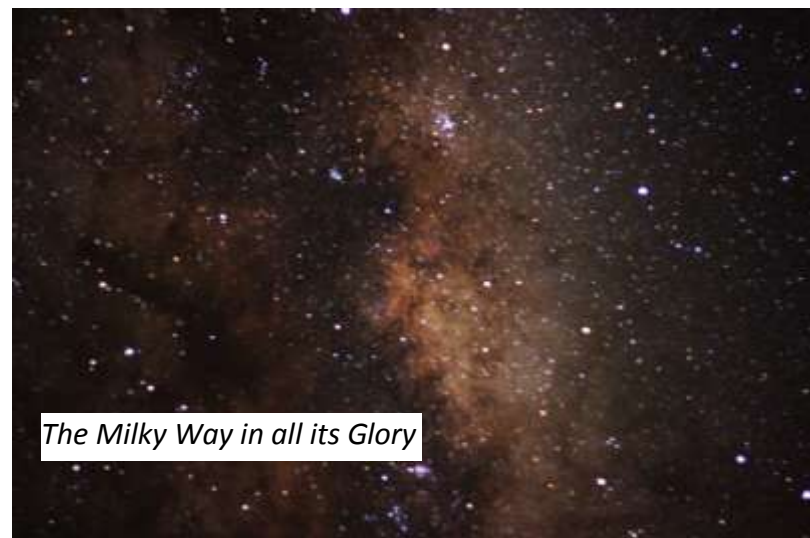
The Milky Way in all its Glory