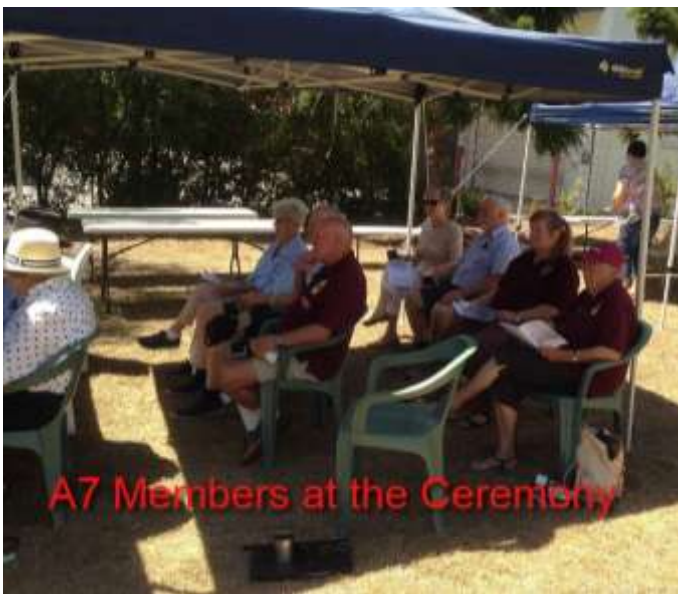
A7 Members at the Ceremony