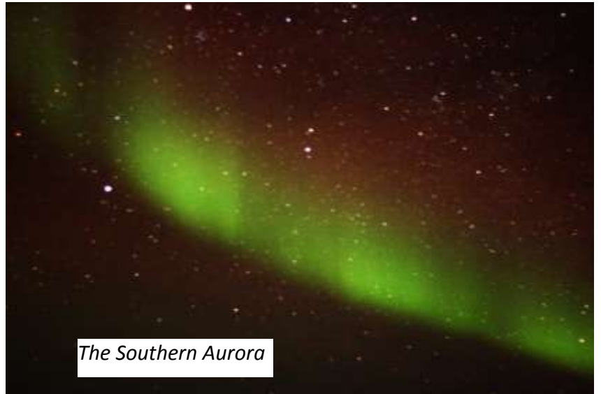
The Southern Aurora

Dinner is set for between 6-6:45. We are spoilt for food here. Our chef never fails to provide a range of tasty dishes that make it hard to be disciplined and