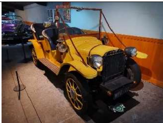
Say hello to "Bessie", which featured in Doctor Who with Jon Pertwee and Tom Baker back in the 1970s. Bessie was a kit car based on a Ford 1954 8hp Popular chassis with a fibreglass body. This was used as a prop when Dr Who was earthbound for a while as the BBC having an economy drive and his Tardis was grounded.

Following are photos and descriptions of some of the cars I saw in April.