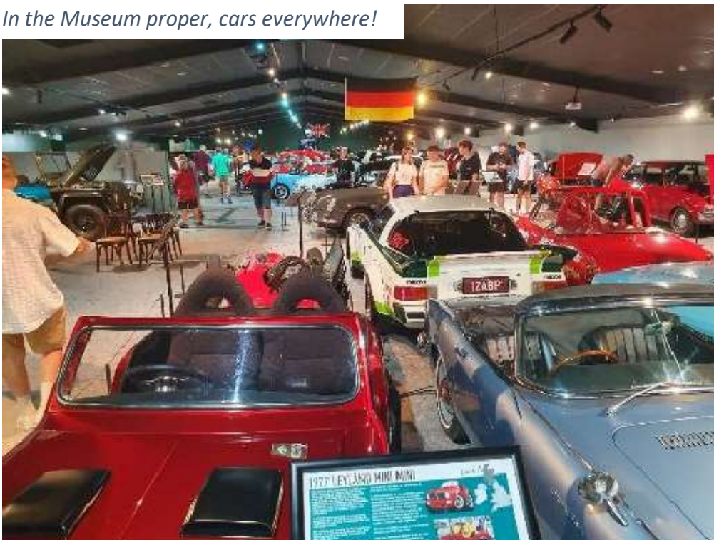
In the Museum proper, cars everywhere!