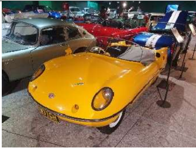
Yes , it is the Dart!!! Between 1957 and 1961 700 Darts were built by Buckle Motors Pty Ltd in Sydney, with fibreglass bodies

One of 3 Austin 7s on display was David Cross's racing A7. See the front page for the others!