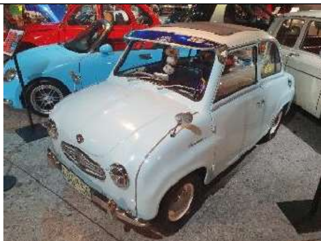
G-O-G-G-O, a lovely little Goggomobil T250 Sedan

Nice two toned Karmann Ghia drew a few compliments