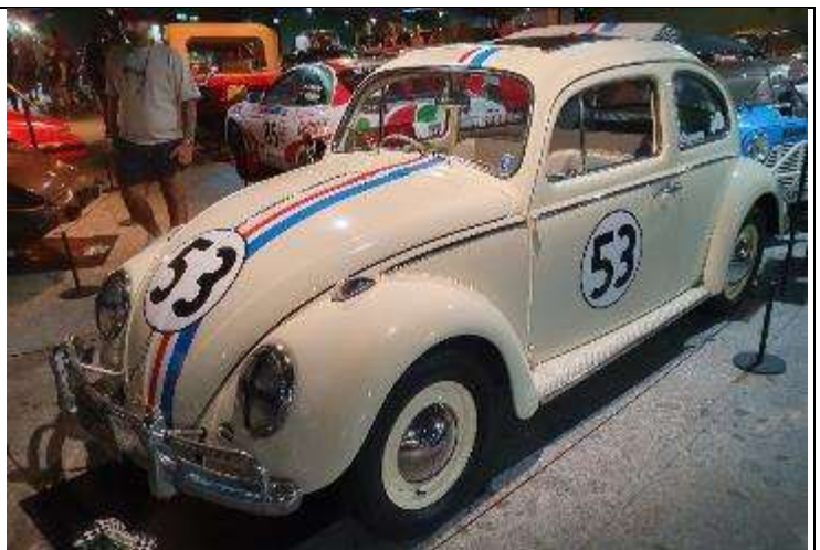
"Herbie the Lovebug" featured in a series of Disney Movies starting in 1969. The car was a 1963 VW Beetle that has a mind of its own! The car in the movie changed a bit in detail as accidents happened. This is a faithful copy that turns up at displays around SE Qld.