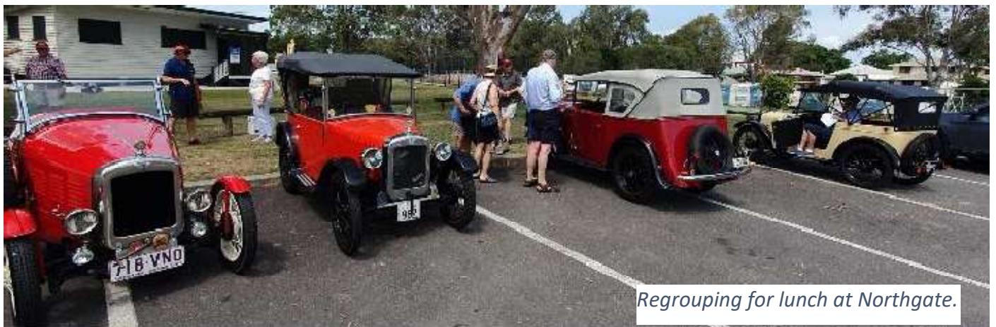
Regrouping for lunch at Northgate.