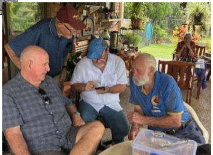
FOUR WISE MEN IN CONFERENCE