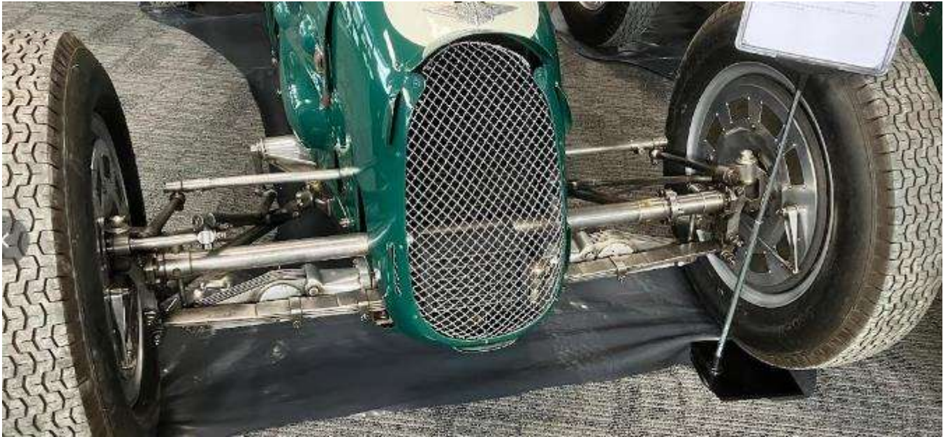
Front axle detail, wonderful!