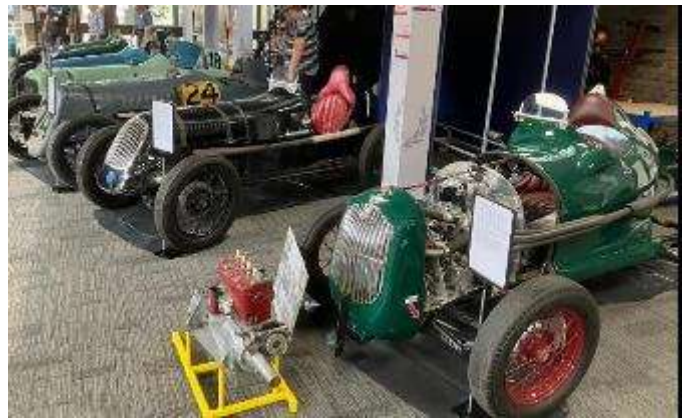
Works Single seater Austin Sevens