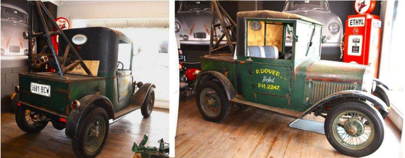
Interesting A7 Tow Truck seen at collectible Classics

Further on by the river is a scenic park with an ANZAC memorial and a historic church.