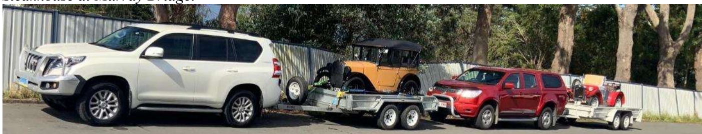
How the cars got there and back again!! (nothing wrong with the Sevens, just the drivers and navigators need longer rests!)