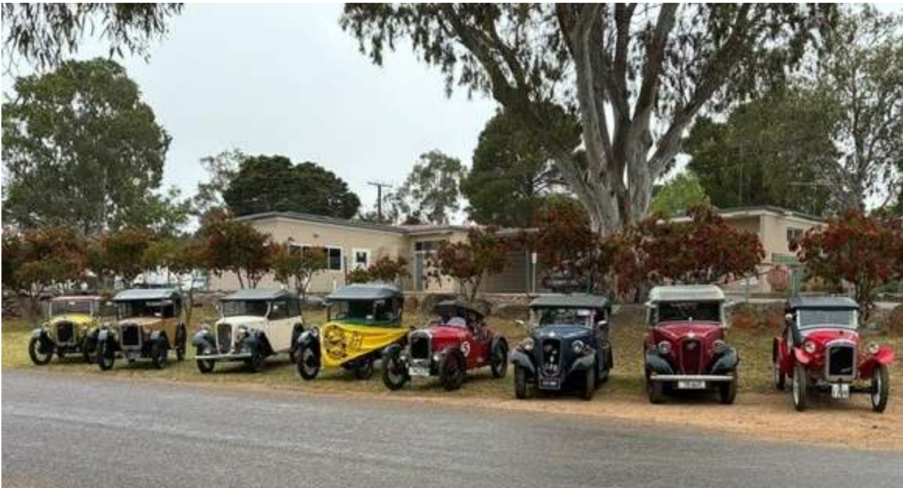
The Queensland club outside the Caravan Park at Murray Bridge

A swap meet was held at the rally starting point. Parts available included headlights, wheel spanners, distributor caps, gauges, ignition coils, cutouts, brochures, mudguards and carbies.