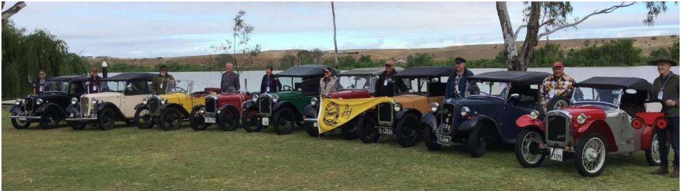
A photo of the Queensland Austin 7 members and baby Austins down on the Murray River

The Austin 7 National Rally was held at Murray Bridge, South Australia from Monday 20th October to Friday 24th October 2025.