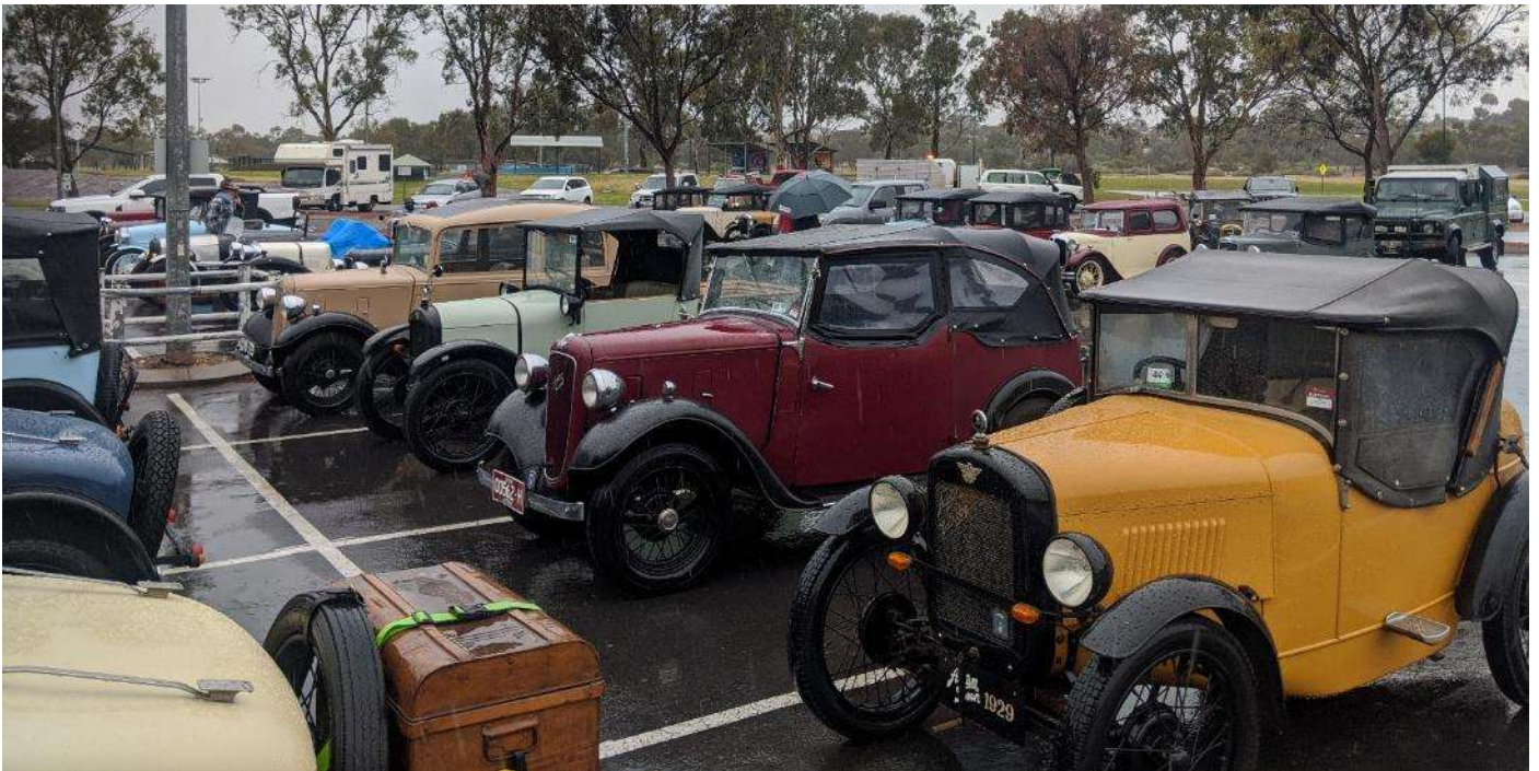
It was rather wet on Day 2 as the Babies assembled at the Sturt reserve

The first motoring day was to the picturesque town of Strathalbyn but unfortunately the weather wasn't the best with rain at times and a strong wind.