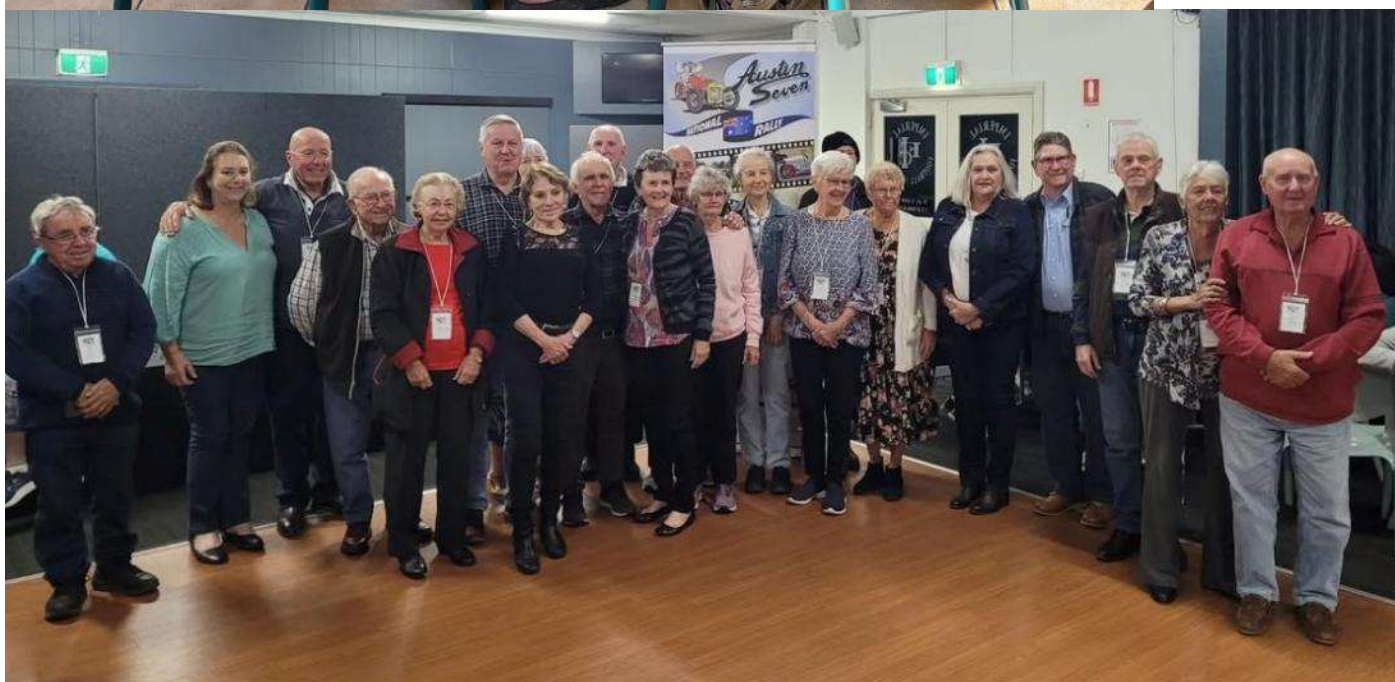
The Queensland Club members who attended the National Rally Welcome Dinner at the 1924 Riverfront Steakhouse at Murray Bridge.