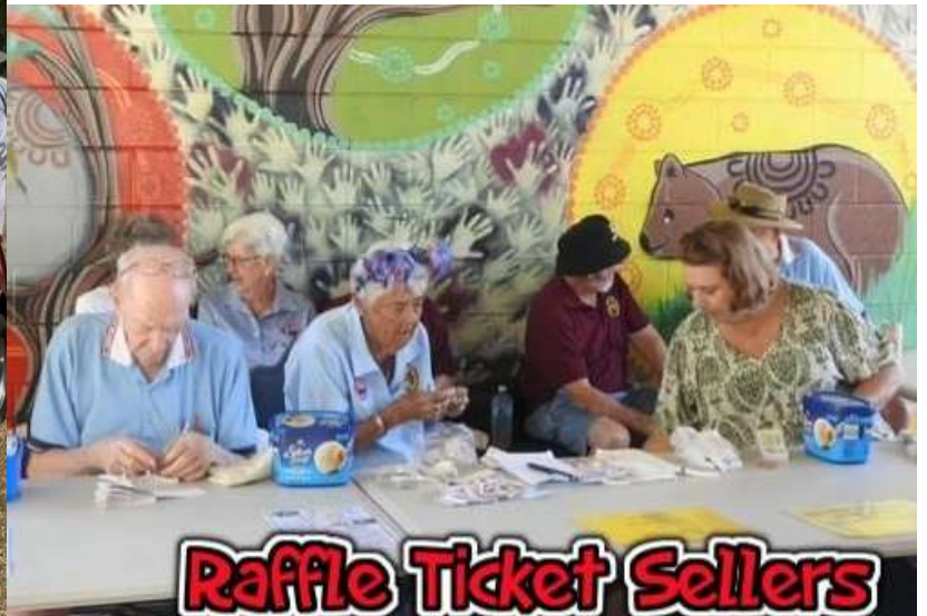
Raffle Ticket Sellers

through the Redlands Coast commenced for some, while for others, it was time to head home and out of the heat.