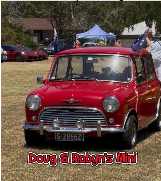
Doug & Robyn's Mini

At around 10am the raffles were drawn and of the eighteen raffle prizes on offer, none of our A7 members were fortunate to score any. Following the raffle draws and at around 10.30am, the optional navigation runs